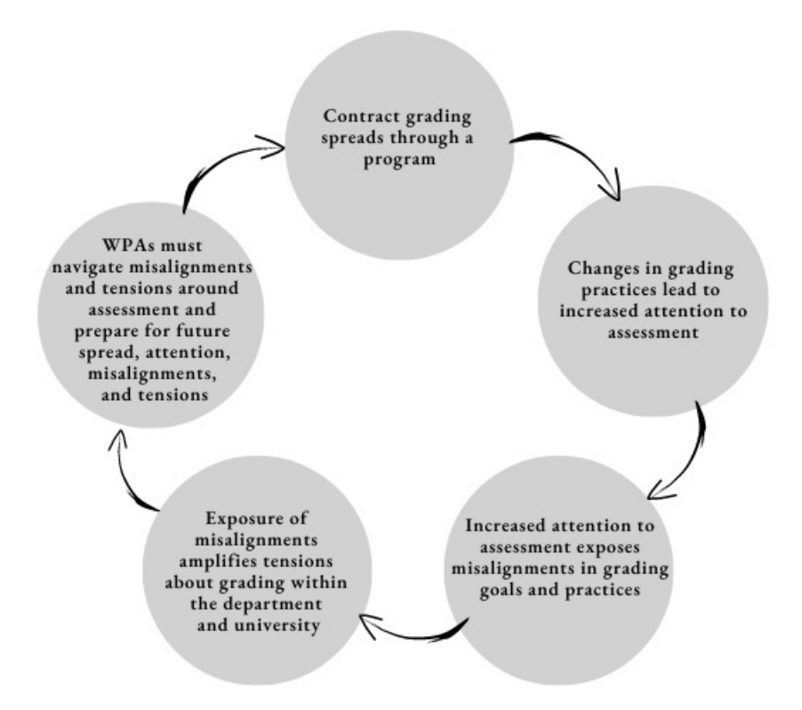
Figure 1: Model of the Impact of Contract Grading on an Assessment Ecology

THE SPREAD OF CONTRACT GRADING THROUGH-OUT AN ASSESSMENT ECOLOGY